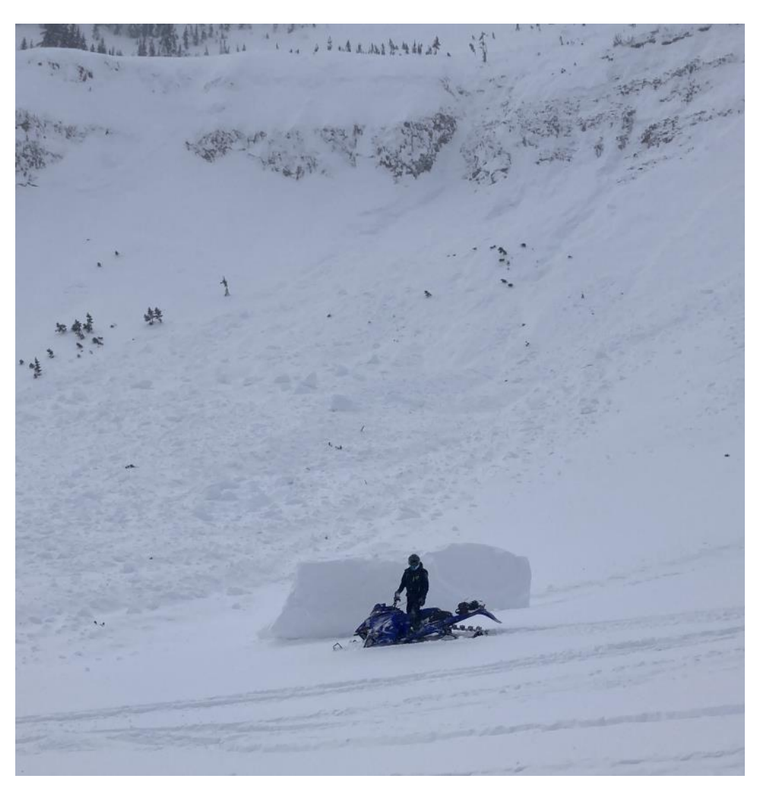
A natural hard slab avalanche at Lionhead.