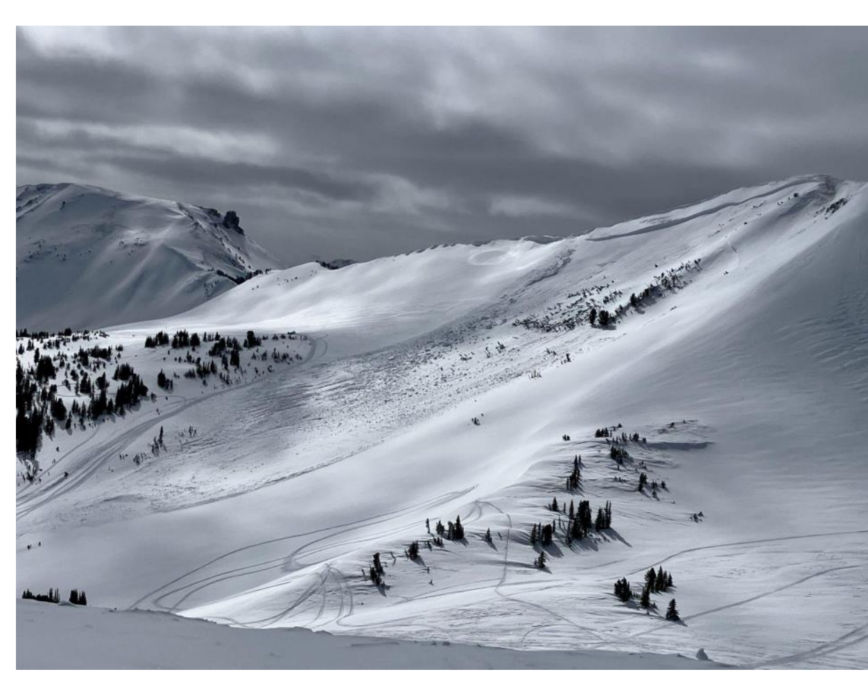
This slide broke naturally the night of March 10-11, 2023 on Fisher Mtn near Cooke City, and appeared up to 10 feet deep. It is on a path that previously produced a 6 foot deep slide in December, triggered remotely by riders near the bottom of the slope.

We are thankful for the support from our partners in the community to help keep everyone safe. We could not succeed without the hundreds of observations submitted by the public, volunteers that join us in the field, and donations from sponsors and individuals.