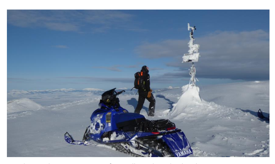
The weather station on top of Sawtelle Peak in Island Park.

We owe a special thanks to Big Sky and Bridger Bowl Ski Patrols for their daily observations as well as Beartooth Powder Guides, Yellowstone Ski Tours, and Six Points Avalanche Education.