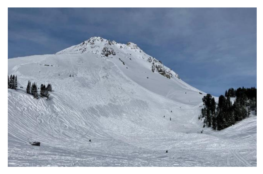
This avalanche killed a snowmobiler on December 31, 2022 on Crown Butte near Cooke City. The rider was not wearing a transceiver and was located with a probe line an hour after being caught and buried.

On December 31 a snowmobiler was killed in an avalanche on Crown Butte near Cooke City. The avalanche broke 1.5-4 feet deep on a persistent weak layer, 500 feet wide, and ran 600 vertical feet. The rider was not wearing an avalanche beacon and was recovered with a probe line an hour after he was buried. Over the prior week the area received 2-3 feet of snow equal to 3.2" snow water equivalent (SWE). Danger was rated MODERATE. Earlier in the day a snowmobiler 2 miles east of the fatal avalanche triggered a 1-4' deep, 150' wide hard slab that broke on a similar layer of weak snow near the bottom of the snowpack. That rider was unharmed.