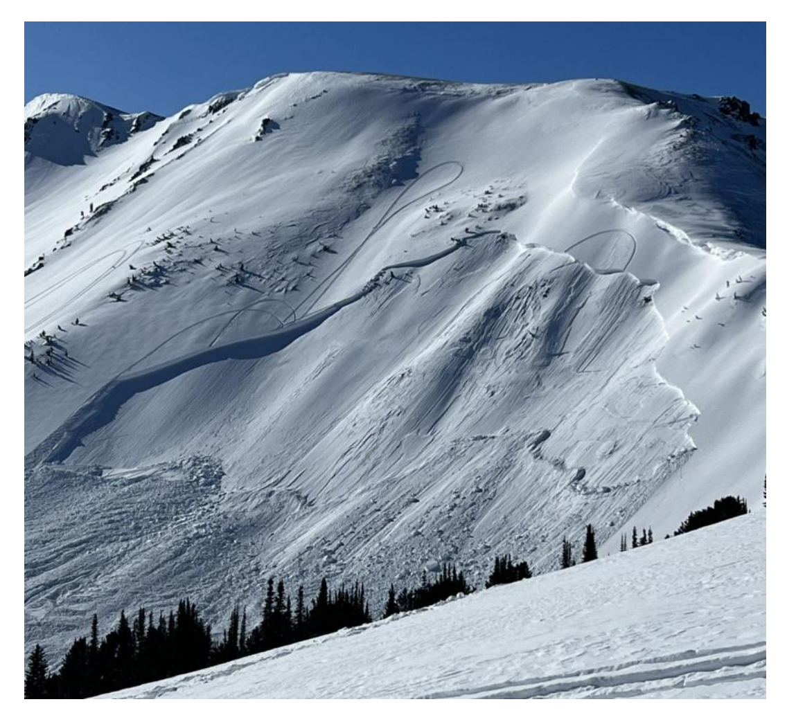
This avalanche was triggered by the fifth rider high-marking the slope on March 18, 2023. He was stuck at the crown and luckily uninjured. The slide broke 5-6 feet deep on a layer of surface hoar that was buried in January. Doug Chabot measured 17" of snow water equivalent (SWE) in the slab above the weak layer at the crown.

One week into April, temperatures frequently climbed above freezing and the snow-pack started to get wet. On April 8 a wet slide from a low elevation south facing starting zone buried a section of highway by Quake Lake near West Yellowstone. As we prepared to culminate daily forecasts, temperatures stayed above freezing in many locations for multiple nights in a row and wet snow avalanche activity continued. With the season's first onset of free water in the snowpack we issued two extra avalanche forecasts which were high danger for large wet snow avalanches on April 9 and 10.