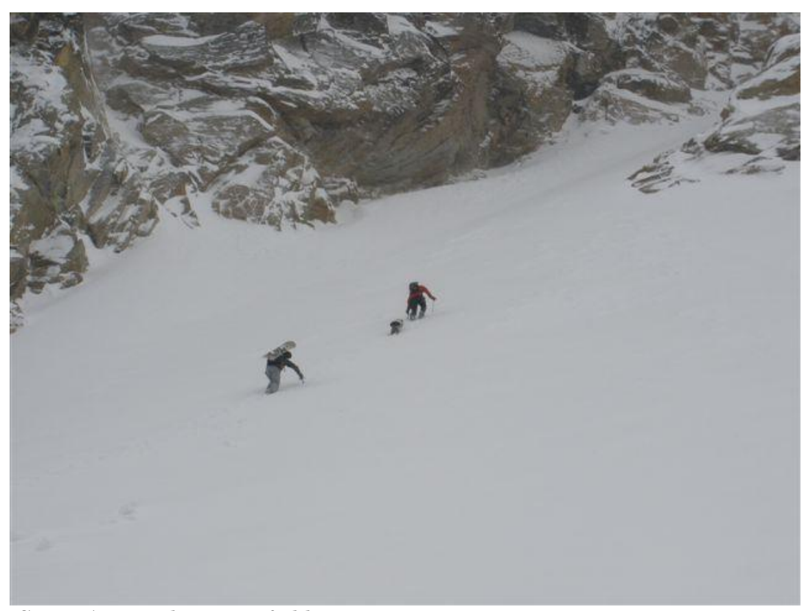
Group A ascending snowfield.