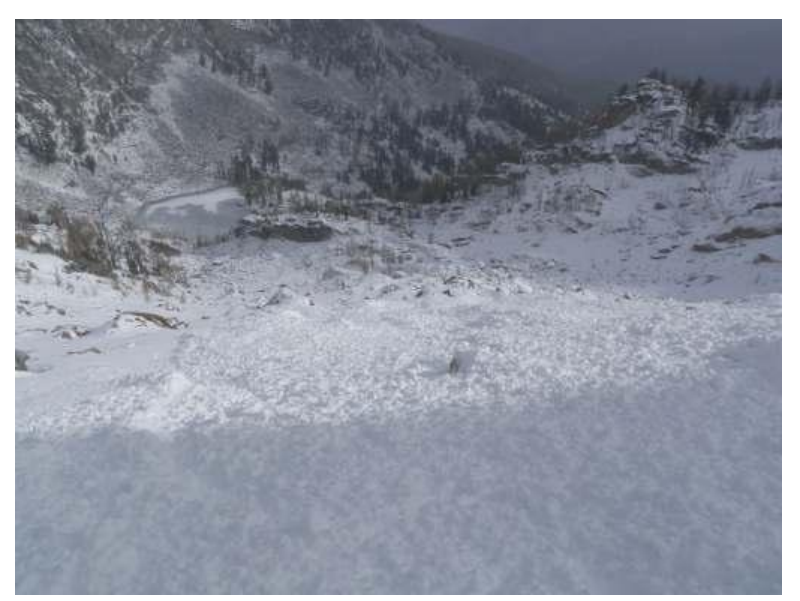
Photo 3; the debris field below the location of the last member of Group B. Depths ranged from a few inches to approximately four feet in small mircosites behind larger boulders in the talus field. From the crown to the end of the debris field was estimated at ~800 vertical feet.