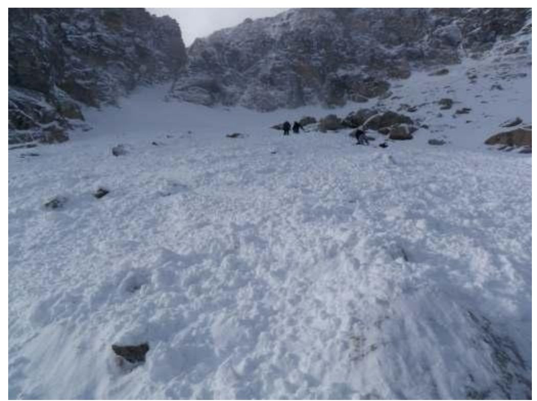
Photo 2; the largest hazard of entrainment in the avalanche was the thinly covered talus slope below the perennial snowfield.