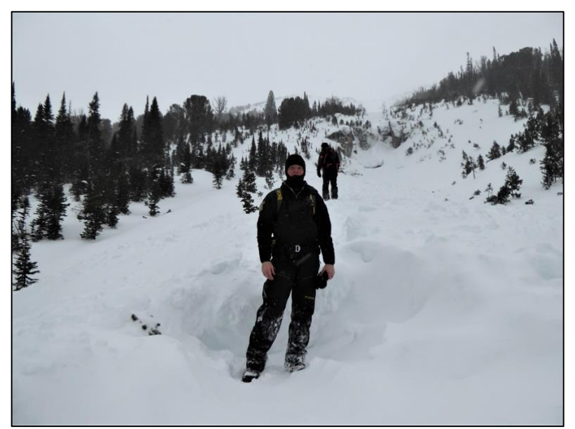
Burial location and debris of slide that killed a rider near Cooke City on February 19, 2022.

On February 19 a snow biker was killed in a large avalanche on Miller Mtn. near Cooke City. Two snow bikers were high on a slope, one stopped on a small ridge while the other climbed higher and triggered the avalanche. He was carried through a gully and over a cliff where he was partially buried with his arm and airbag visible and head 1 foot under the surface. Danger was moderate and the area had received about a foot of snow equal to 1" SWE over the previous week along with strong westerly winds. The avalanche likely broke on facets that formed in January in an area that was thinly covered and recently wind-loaded.