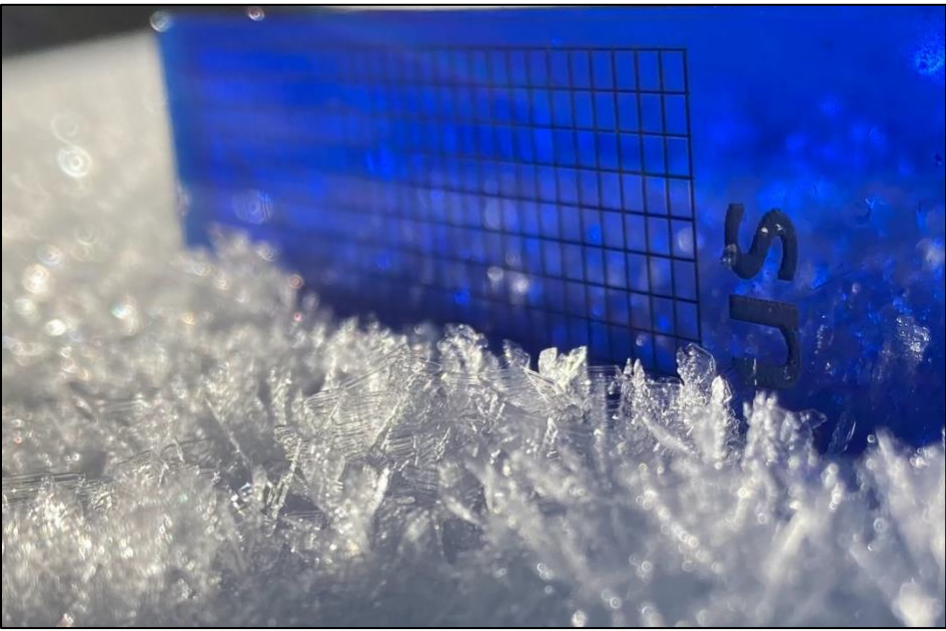
Surface hoar that grew during extended dry weather in January.

layer of facets 1.5 feet off the ground. The area had received 7-9 feet of snow equal to 8.9" snow water equivalent (SWE) from December 6 through 27.