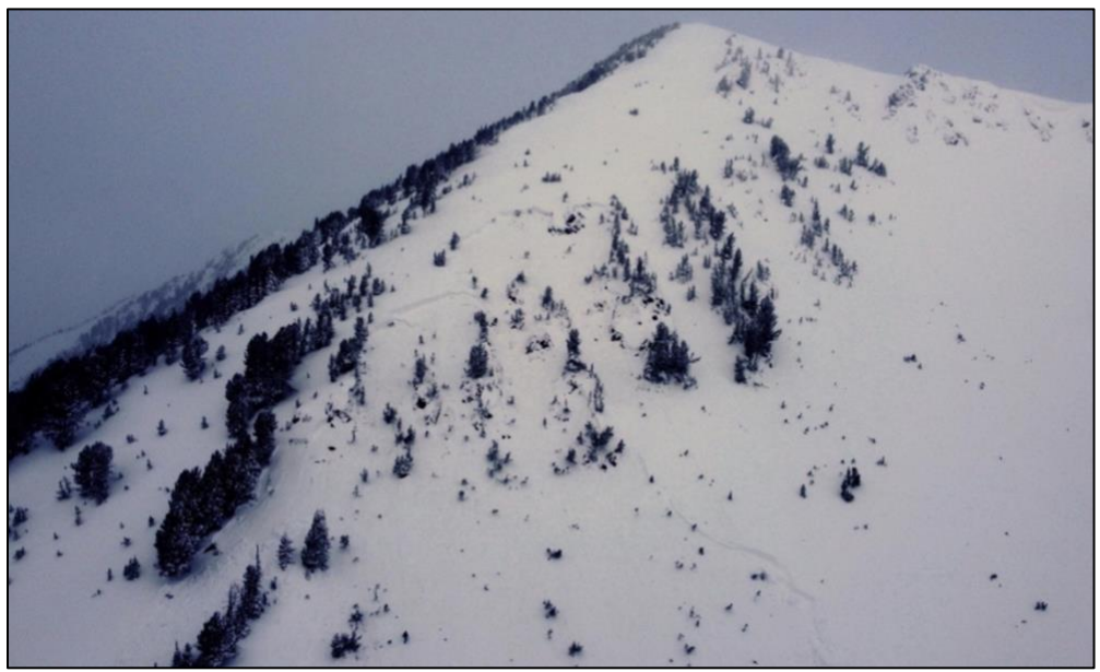
Crown of the avalanche that killed two snowmobilers near Cooke City on December 27, 2022.

We issued our first daily forecast with danger ratings on December 10, with a moderate danger throughout the area. Through December, steady snowfall and wind kept danger at moderate to considerable. We issued two consecutive avalanche warnings for the mountains near Island Park when they were favored with heavy snowfall in mid-December. These would become the only warnings we issued this season.