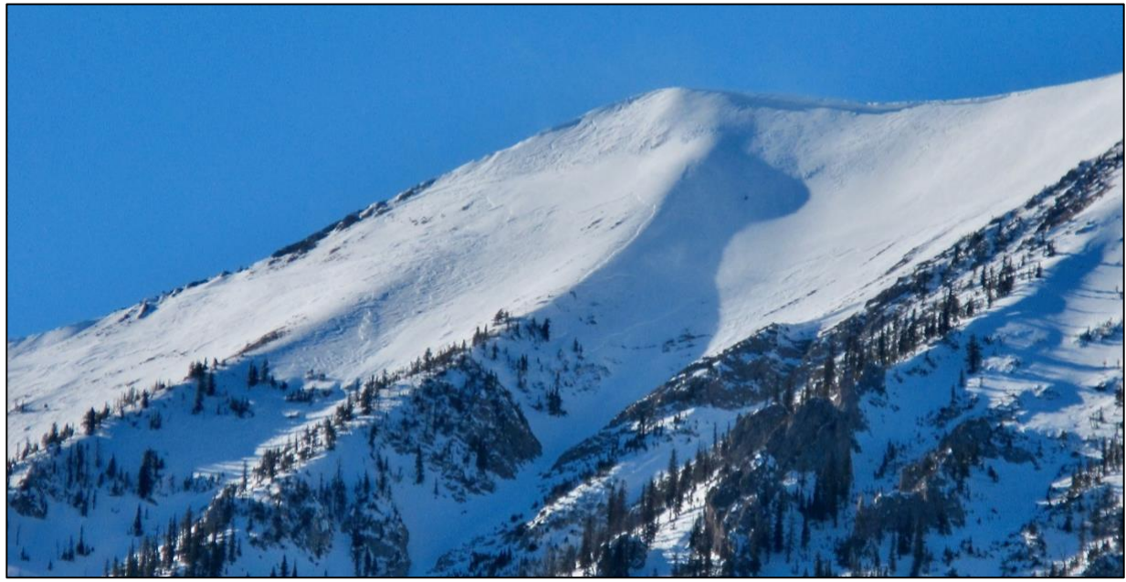
Shallow, wide avalanche on Saddle Peak that occurred during low avalanche danger on approximately January 25, 2022.

We are thankful for the support from our partners in the community to help keep everyone safe. We could not succeed without the hundreds of observations submitted by the public, volunteers that join us in the field, and donations from individuals and sponsors.